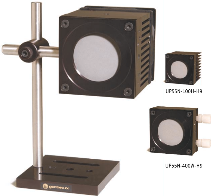
UP55N-300F-H9 Deluxe Stand