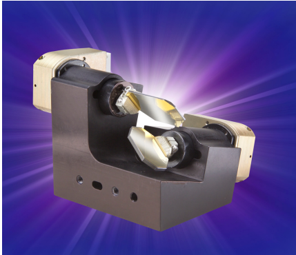
XLR8 Open Frame Heads For 3, 5, 7, 10, 15, 20, 30 & 45mm