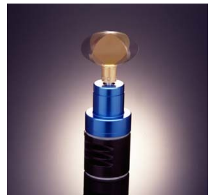
QuantumScan-30™ For 20 - 50 mm Beam Apertures

The galvanometer's stator is thermally isolated and located far away from the position detector. This reduces thermally induced drift; a patent pending feature found only in NTI galvanometers.