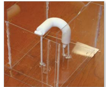
Figure 5: The pattern is mounted on dowels and attached to the floor of the mold box.