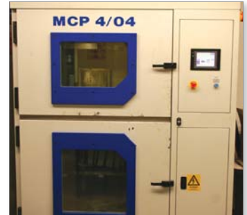
Figure 8: The two-part urethane and RTV mold are placed in the automated vacuum casting machine.

Vacuum casting machine: MCP Group ( www.mcp-group.com )