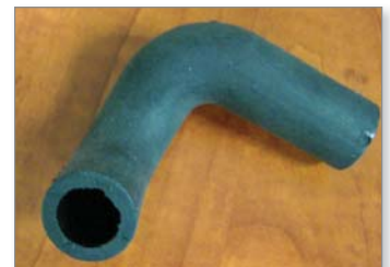
Figure 11: Final hose-part