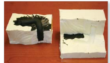
Figure 9: A urethane casting, with the soluble core, prior to extraction from the RTV mold. The black material on the mold's surface is flash from the casting operation.