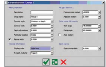
Figure 3: Insight custom group selection

Insert a soluble core into one side of the RTV mold. Prior to closing the mold, spray both sides with mold release. Then, close the mold and tape it shut. The cast urethane parts can be gravity,