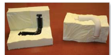
Figure 7: The finished RTV mold with the pattern placed in the mold (left) and soluble core inserted (right).