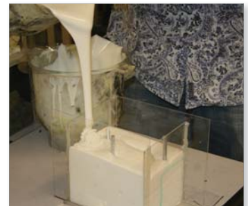
Figure 6: The RTV rubber is poured into the pattern and then allowed to cure.