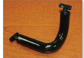
Figure 4: A soluble core for the radiator hose.