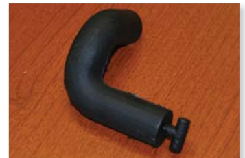
Figure 10: Finished hose part with soluble core in.