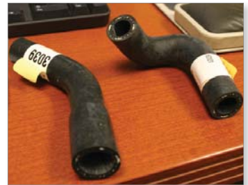
Figure 1: These hoses are examples of parts that need soluble cores since the RTV tool cannot be extracted from the internal passage.