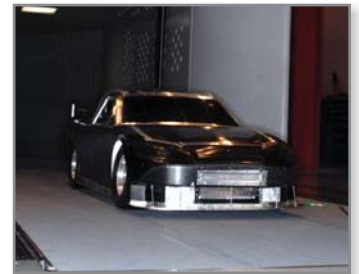
Figure 1: NASCAR teams rely on rolling-floor wind tunnels to analyze aerodynamics of their race cars.

A technical representative from a major automotive manufacturer states, "We have been conducting wind tunnel testing with FDM parts for several years with tremendous success. We