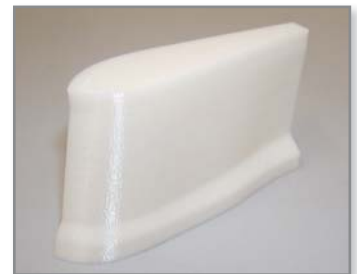
Figure 3: The vertical build orientation of this airfoil produces smoother surfaces that many not need finishing.