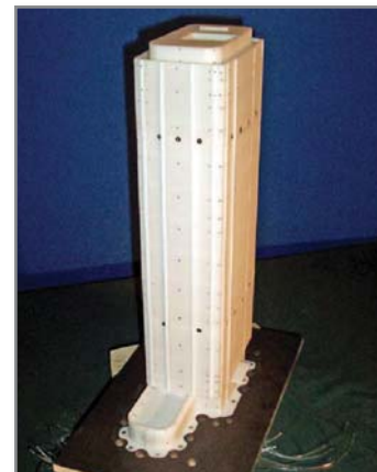
Figure 5: Architectural wind tunnel models are constructed with pressure tap holes to eliminate the time and expense of manual drilling.

These results are attainable by companies in any industry of any size. A major corporation making aircraft or automobiles can apply FDM to its wind tunnel testing applications. Likewise, a smaller organization that optimizes race cars or designs skyscrapers can turn to FDM to get the wind tunnel test data needed to refine the design for performance and endurance.