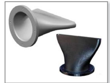
Figure 4: Rear tire blower nozzle for a Joe Gibbs Racing car. CAD model (left), FDM model (right).