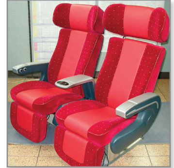
Hanil E-Hwa is a tier one supplier of automotive interior parts including seats and door panels.

The Hanil E-Hwa design team has used other prototyping methods such as photopolymer and sintering technologies, but find that FDM is a superior process. “Team members say that FDM has advantages that include part strength and ease of