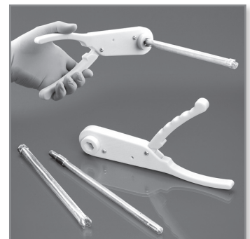
Image 3: Ratchet prototype made from tough polycarbonate using the FDM process.