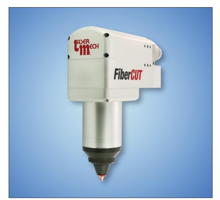
By locating all wiring and assist gas lines within the head, the potential for downtime due to snags and breaks is virtually eliminated.