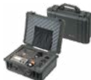
Pelican Carrying Case